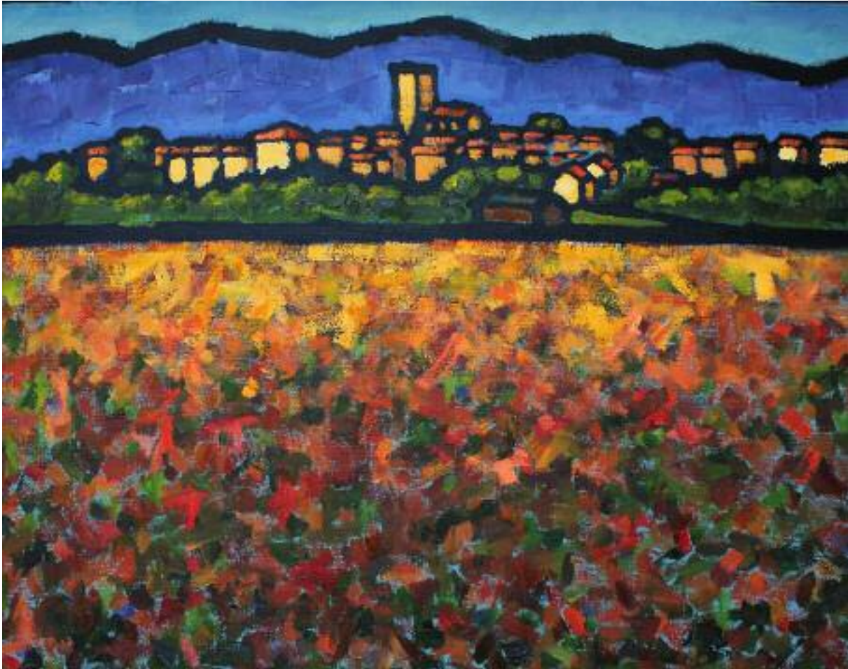
Azille, Autumn Vines 30" x 24" oil on canvas £1,600