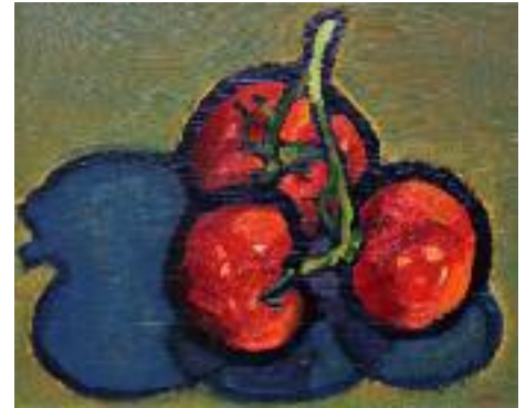
Still Life with Blue Bottle