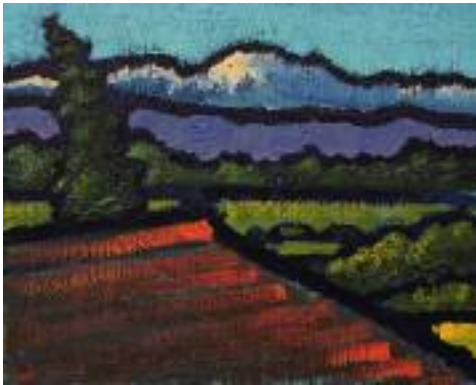
Across the Rooftops, La Livinière 10" x 8" oil on board £450