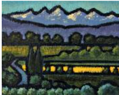
Azille, Vines, Springtime 10" x 8" oil on board £450