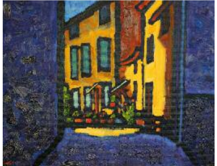
Azille, Matin 20" x 16" oil on canvas £995