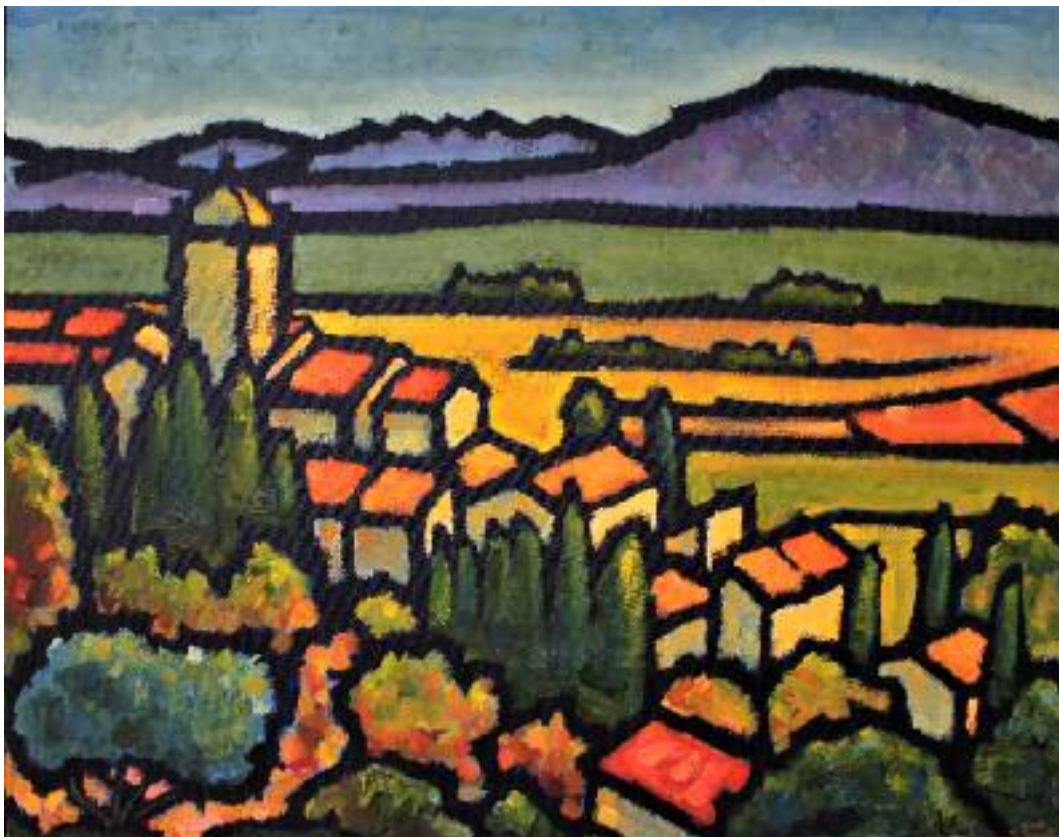
La Livinière, Autumn