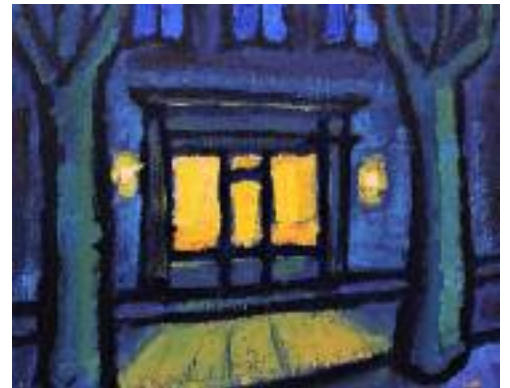
Azille, Restaurant, Dusk