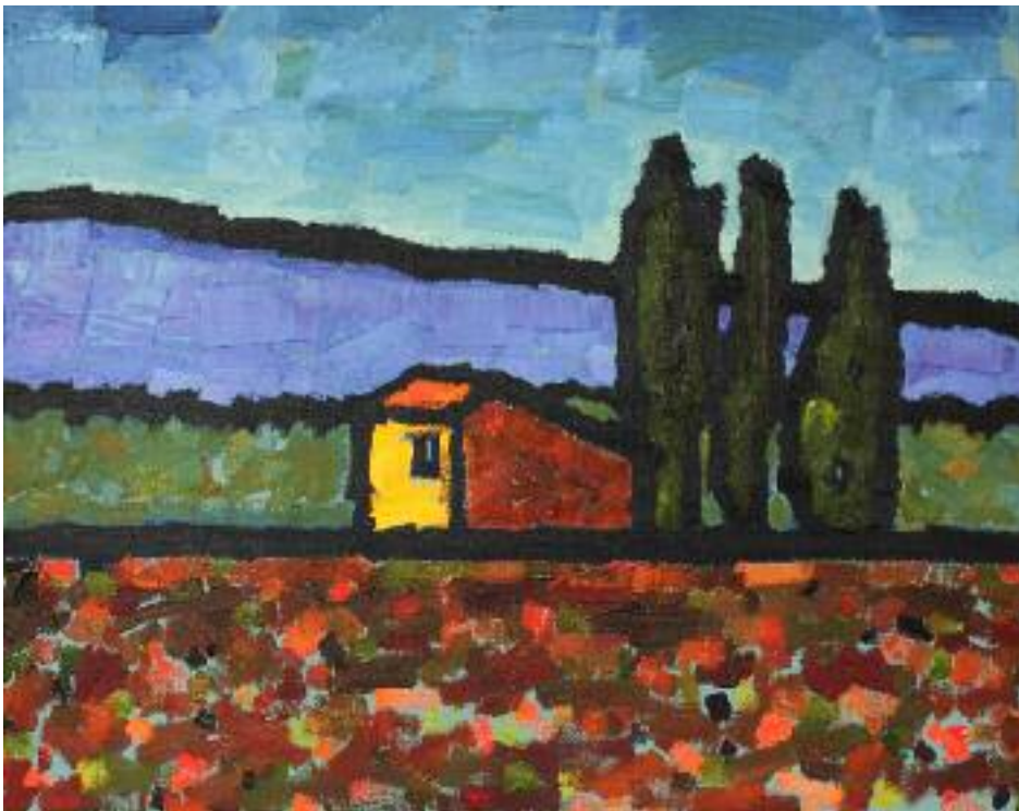
Hut near Canal du Midi