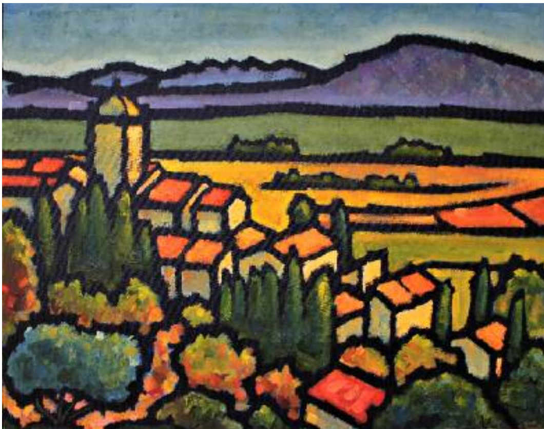
La Livinière, Autumn