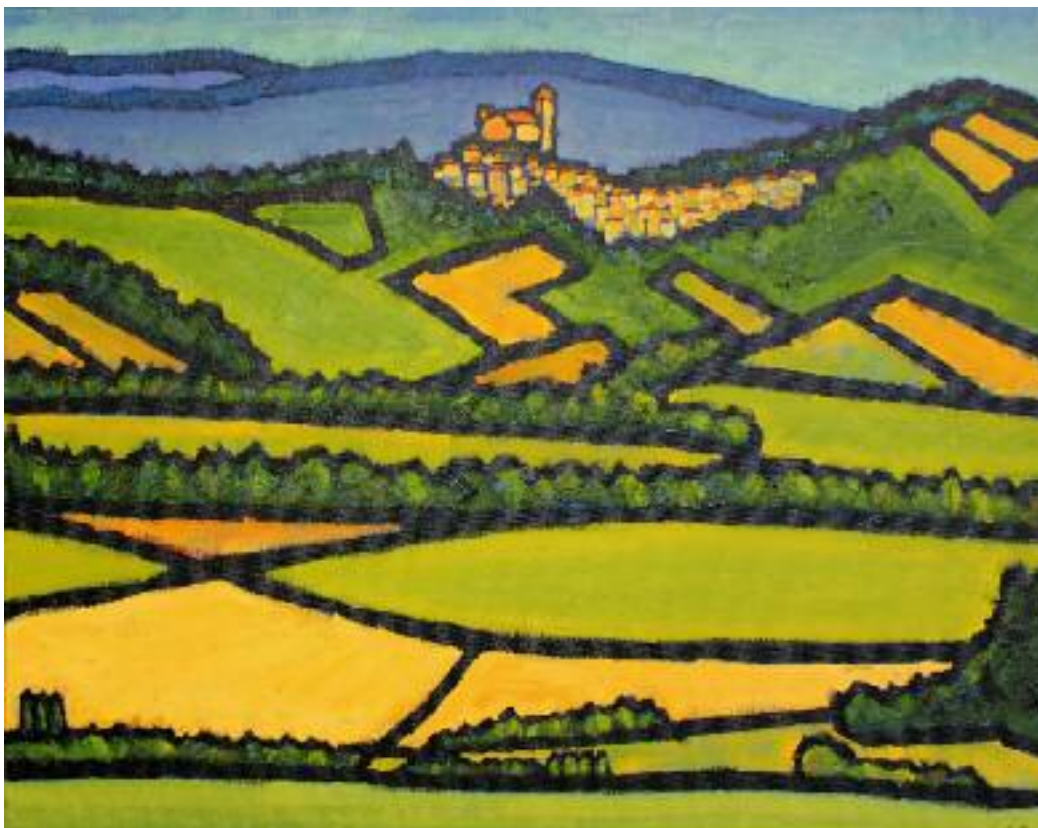
Montreal, Summer 30" x 24" oil on canvas £1,600