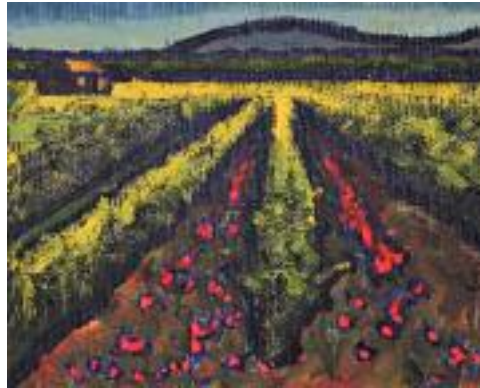
OPPOSITE Looking towards Lezignan 30" x 24" oil on canvas £1,600