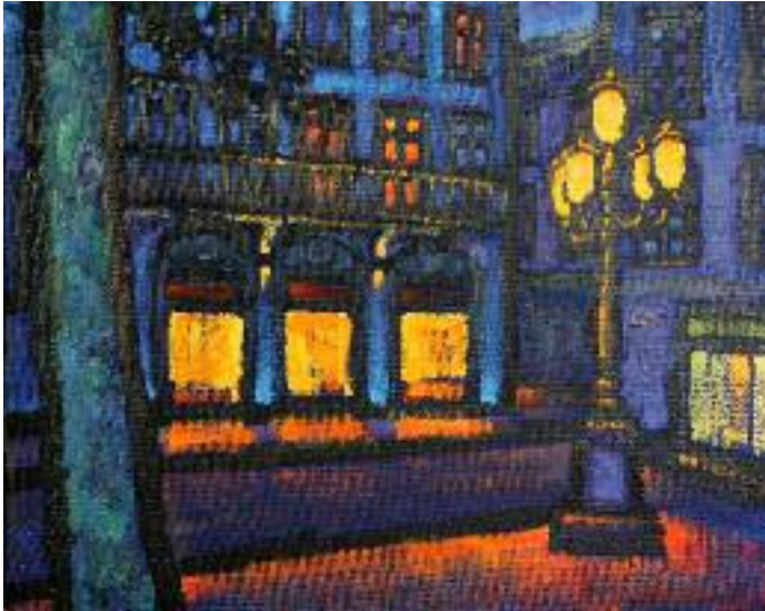
Carcassonne, Soir 20" x 16" oil on canvas £995