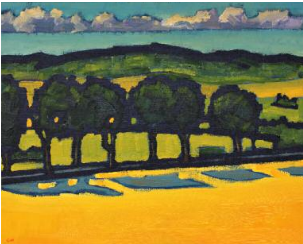
The Road to Fanjeux, Summer