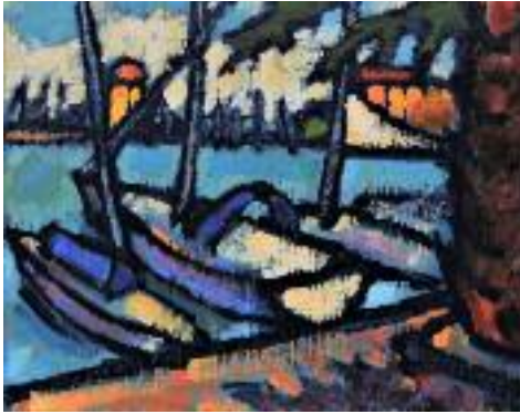
Guissan Harbour 10" x 8" oil on board £450