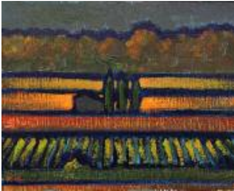
Across the Vines, Azille 10" x 8" oil on board £450