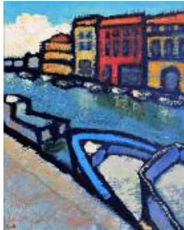
Sète 10" x 8" oil on board £450